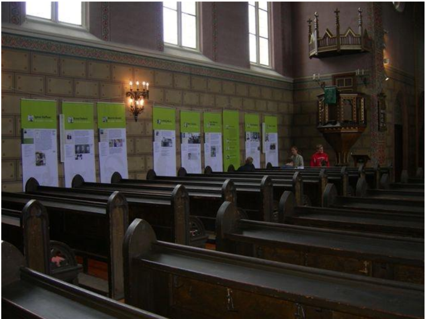
Interior of Johanneskirche, Klagenfurt with some of the biography banners

Information on the establishment of the project, as well as two banners with background information to Dachau Concentration Camp. The topic aims to include young people as much as possible; at the moment there are groups of German high school students writing biographies for extra curricular credit.