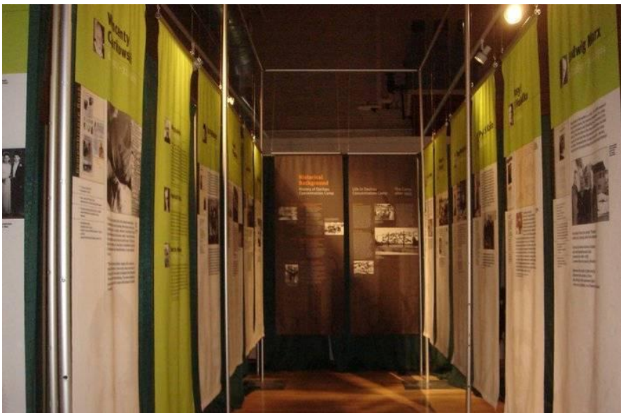
The exhibition nicely displayed at the NYS Military History Museum.

The exhibition's debut in North America was conducted with overwhelming success at the New York State Military History Museum and Veterans Research Center in Saratoga Springs, NY. The museum displayed the exhibition for two weeks and did an excellent job advertising the event in local newspapers and in the news before and after the exhibition. Further, the museum invited members of the United States' Army's 42 nd Infantry "Rainbow" Division, liberators of the Dachau Concentration Camp, to share their stories with the public on April 29, 2011, the 66 th anniversary of the liberation of the camp. From there, the exhibit was successfully displayed in multiple other sites in the United States and is now touring in Canada.