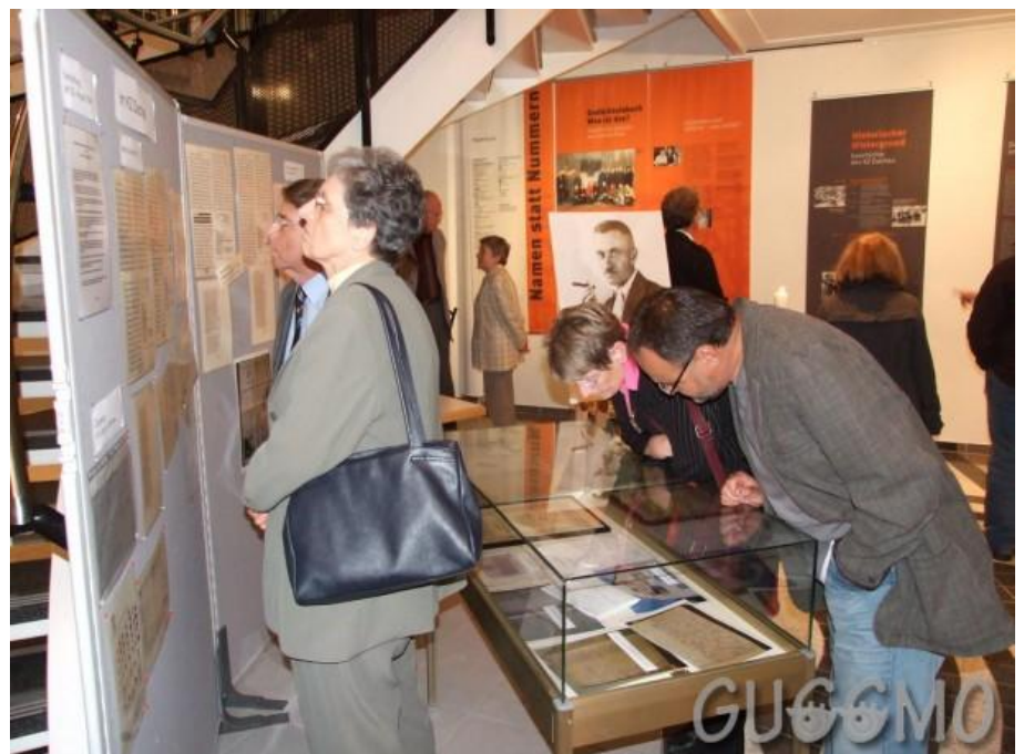
Documents collated from a number of archives were on display for visitors to see.