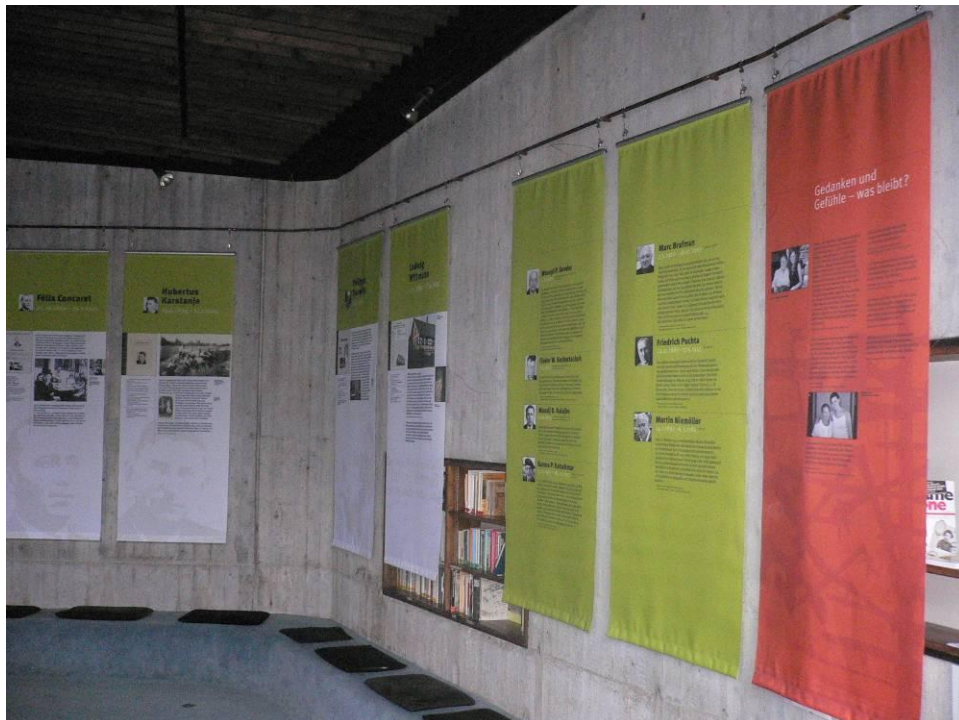
Display in the Reading Room of the Protestant Church of Reconciliation, Concentration Camp Memorial Site Dachau. Banners shown include four full biographies, two biography summaries and a concluding banner on the concept of remembrance.

Exhibiting organizations are warmly encouraged to get involved in the project as producers of a biography. This is a fantastic way of allowing young people to better understand the complex history of the Nazi persecutions, and also to learn more about peoples' lives before and after their internment.