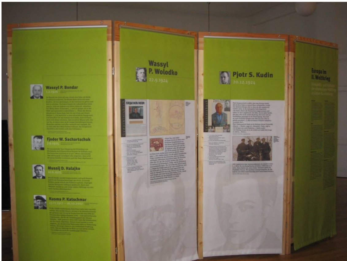
The exhibition can be hung in a number of ingenious ways. This example from Gießen, Germany, demonstrates one way of displaying the exhibition without hanging from the wall. Two banners have been tied to each other by their hooks and hung over a display board.